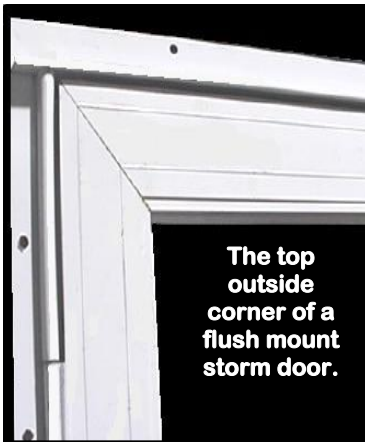
The top outside corner of a flush mount storm door.