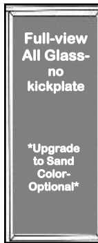
Full-view All Glass- no kickplate