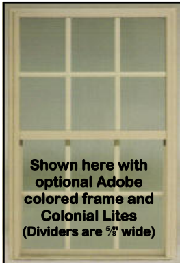
Shown here with optional Adobe colored frame and Colonial Lites (Dividers are 3/8" wide)

Fusion welded frame & sash provides a solid barrier to air & water penetration- Unique cove mold look & soft curve sash design offers an appealing traditional wood window exterior appearance- Sloped sill provides maximum water runoff- weather stripping to fight air infiltration- Heavy walled construction for maximum support, no adjustment needed- NFRC Rated, Energy Star Approved and TDI compliant- Sturdy Cam Lock and Keeper- 3/4" Insulating Thermal glass system with advanced non-conductive edge spacer retards heat/cold transfer through the edge of the glass for additional energy savings- Heavy duty metal spire balances for easy sash operation. No ropes or pulleys to wear or break- Sash tilts inwards for easy cleaning from inside the home- Aluminum glazing beads holds up against the sun's damaging UV rays, will not crack and warp like common plastic window glazing beads, eliminating the possibility of air and water leakage.