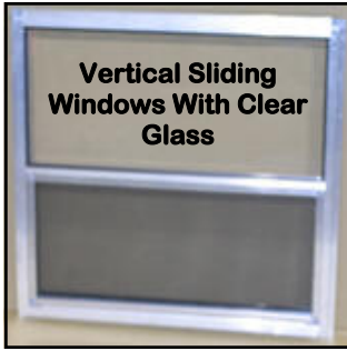
Vertical Sliding Windows With Clear Glass

Standard Features: *Aluminum Frame *Inset depth 1 7/16" *1/2" Screen *1" Wide Exterior Flange Window Options: *Grid Patterns *Additional Lap Flange *Obscure Glass (Window options not available for 14 x 20 sizes)