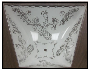
▲ 50078 - 12" Square Glass Shade- White *Use with #50086 fixture and #50083 nut.