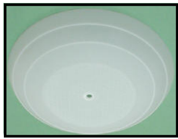
▲ 50077 - 13 1/2" Plastic "Dog Dish" Shade *White -13 1/2" diameter, 3 1/8" high. Use with #50086 fixture and #50083 nut.