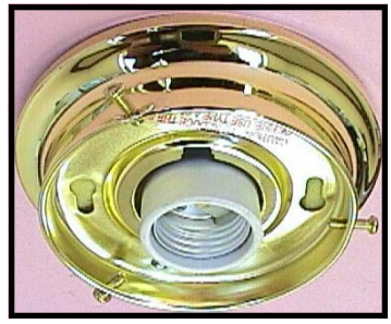
▲ 50070 - Fixture for 6" Round Light Globes *Polished brass finish. 2" deep x 4 7/8" diameter. 1 socket.