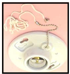
▲ 50090 - Light Fixture with Pull String *White Porcelain. 1 socket.