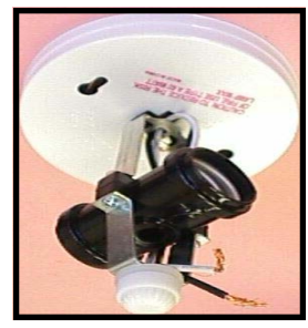
▲ 50086 - Insulated Metal Base for #50077 and #50078 shades *White finish. 6" projection. 2 socket.