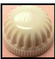
◀ 50083 White Plastic Finial Nut *For use with #50077 and #50078 shades.