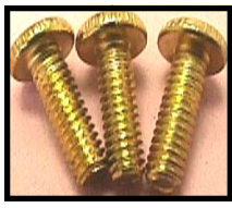
◀ 50085 Brass Thumb Screws *For #50070 fixtures. Sold 3 per Package.

For exterior light fixtures, see page 67.