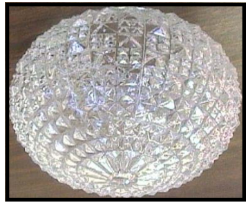
▲ 50068 - 6" Globe/ Clear Crystal Glass *6" deep, 6" high, 3 1/4" neck.