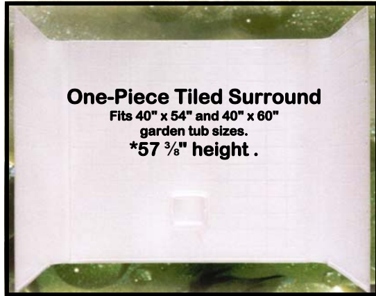
One-Piece Tiled Surround Fits 40" x 54" and 40" x 60" garden tub sizes. *57 3/8" height.