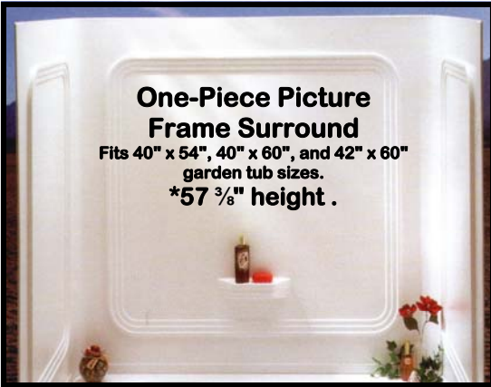
One-Piece Picture Frame Surround Fits 40" x 54", 40" x 60", and 42" x 60" garden tub sizes. *57 3/8" height.