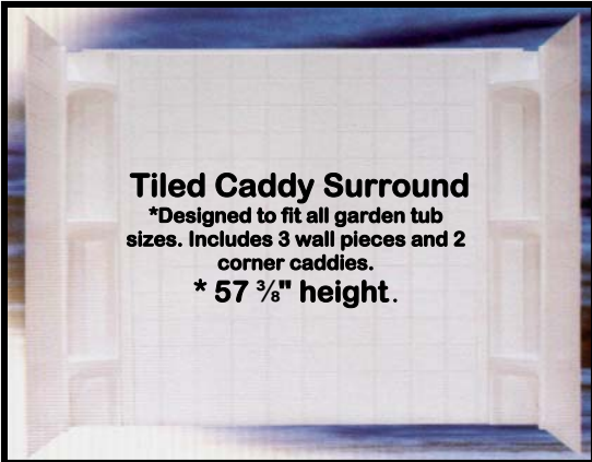
Tiled Caddy Surround *Designed to fit all garden tub sizes. Includes 3 wall pieces and 2 corner caddies. * 57 3/8" height.