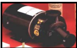
◀ 39100 - 3/4 HP Replacement Motor for Whirlpool Tub

You must specify if you want whirlpool motor on LEFT or RIGHT !