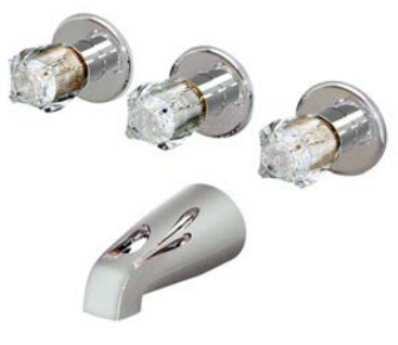
▲ 36175 - Concealed 3 Valve Brass Tub/ Shower Diverter *Includes shower head, arm and flange.