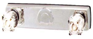
▲ 36174 - Shower Valve Only- *Clear plastic handles. For shower-only application.