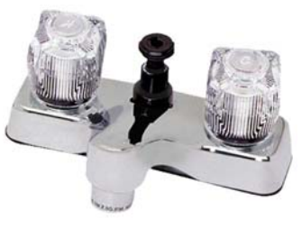
◀ 36173 Lavatory Faucet with connection for # 36152 hose *For hand held hose assembly, see page 42.

For faucet replacement handles and parts, see page 47.