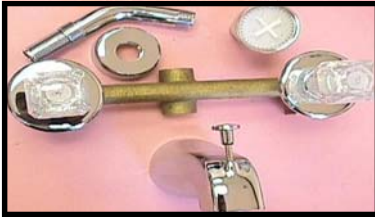
◀ 36171 - 8" Two-Valve Brass Tub Shower Diverter - *Includes shower head, arm and flange