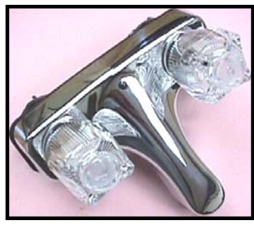
36177 - Plastic Body- Chrome Finish ▶