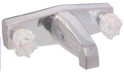
36124 - 8" Tub Filler Only- Exposed Body ▶ Less diverter option, for bathtub-only applications.