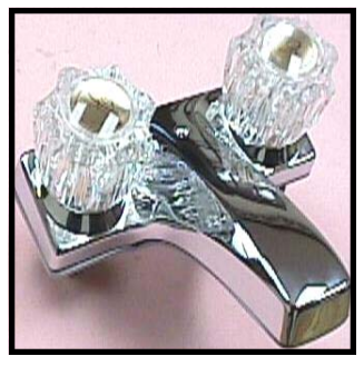
◀ 36177-BR - Brass Waterworks *Less Pop-up Assembly.