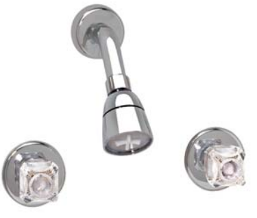
▲ 36178 - 8" Concealed Shower Valve *Includes shower head, arm and flange.