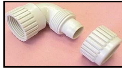
▲ Swivel Elbow (Tub and Faucet Connection to Flair-It)