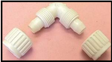
▲ Elbow (Flair-It Connections on both ends)