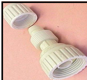
◀ Swivel Connection