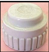
◀ Threaded Cap (used to cap off a plastic fitting)