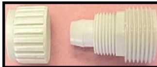
◀ Garden Hose Adapter (Hose Connections)