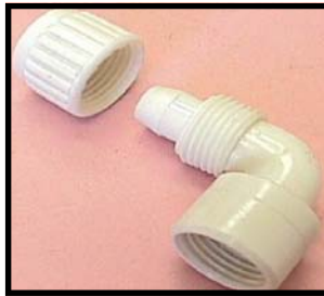
▲ Female Street Elbow (with FPT connection on one end)