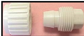
◀ 02871- Icemaker Adapter- 1/2" x 1/8" FIP