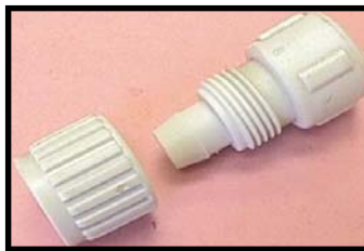
◀ Female Adapter (with female connection on one end)