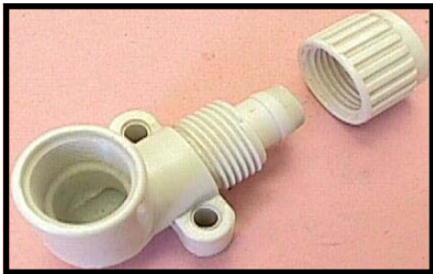
▲ Drop Ear Elbow (Shower and Tub connection to Flair-It)