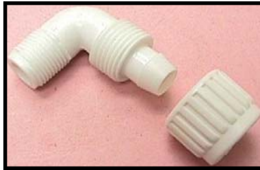
◀ Male Elbow (with MPT Connection on one end)