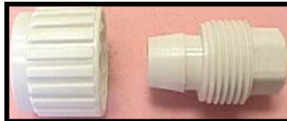
◀ 02871- Icemaker Adapter- 1/2" x 1/8" FIP