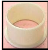
◀ 06792 Polybutylene to Pex Adapter / Bushing

*Required when connecting any Flair-It fitting to 3/4" Polybutylene