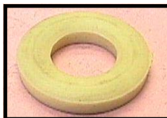
◀ 02483 Saniprene Garden Hose Seal