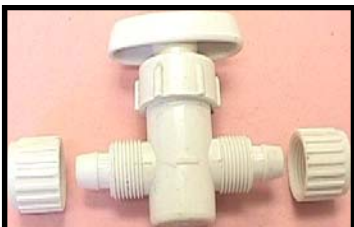
▲ Straight (In-Line) Stop Valve