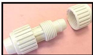
▲ Plug (used to plug into ends of tubing) 02862 - 3/8" Plug 02863 - 1/2" Plug 02864 - 3/4" Plug