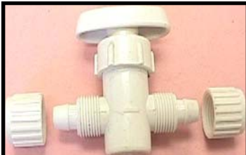
▲ Straight (In-Line) Stop Valve