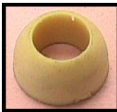
◀ 02482 Saniprene Ball-cock Seal