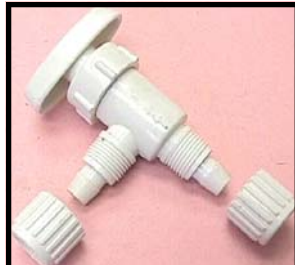
◀ 02885 Angle Stop Valve (90°) 1/2" x 1/2"