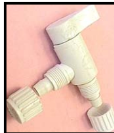
◀ Angled Drain Valve 02882 - 3/8" x 3/8" 02884 - 1/2" x 1/2"