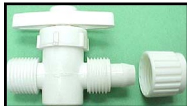
▲ 02889 - 1/2" x 1/2" MPT Stop Valve

02865 - 1/2" x Ball-cock Swivel 02869 - 3/8" x Ball-cock Swivel