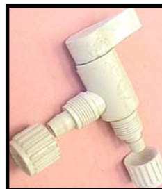
◀ Angled Drain Valve 02882 - 3/8" x 3/8"