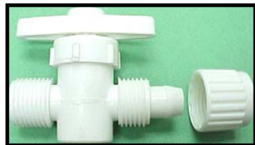
▲ 02889 - 1/2" x 1/2" MPT Stop Valve