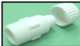
02872 - 3/4" MPT x Water Heater Connection ▶