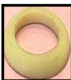
◀ Saniprene Swivel Seal 02435 - 1/2" 02465 - 3/4"