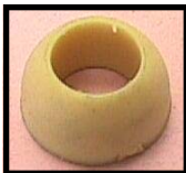
◀ 02482 Saniprene Ball-cock Seal

02872 - 3/4" MPT x Water Heater Connection ▶