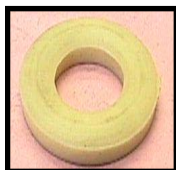
◀ 02483 Saniprene Garden Hose Seal