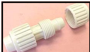
▲ Plug (used to plug into ends of tubing) 02862 - 3/8" Plug 02863 - 1/2" Plug 02864 - 3/4" Plug