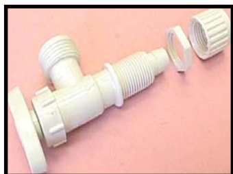
▲ 02887 - Hose Bib Washing Machine Valve- 1/2" PEX *Flairs to Polybutylene or PEX tubing.

*Required when connecting any Flair-It fitting to 3/4" Polybutylene