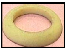
◀ Saniprene Swivel Seal 02435 - 1/2" 02465 - 3/4"