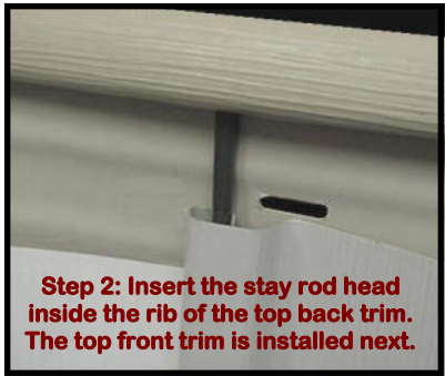
Step 2: Insert the stay rod head inside the rib of the top back trim. The top front trim is installed next.