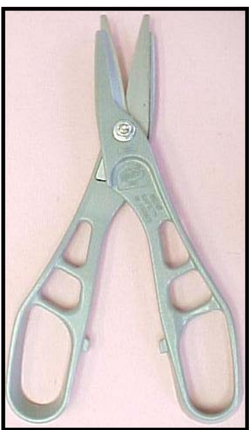
▲ 70294- M12 Tin Snips *For cutting panels and trim. Easy to use and durable. 12" length.