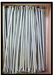
▲ 48211- 7" Ground Spikes *We recommend using 7 spikes per vinyl ground channel, and 6 spikes per steel "J" channel for firm soil. Number of ground spikes used will vary depending on your soil type.