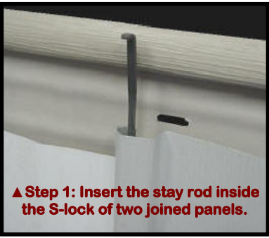
▲ Step 1: Insert the stay rod inside the S-lock of two joined panels.

*For use with vinyl skirting. Allows panel to expand and contract with seasonal changes. Using 1 rod for every 3-4 panels is recommended. Use more frequently for taller panels or windy areas, or upgrade to 24" rods. 70000- 12" Length *For panels up to 36" tall 70001- 24" Length *For panels 36" and taller