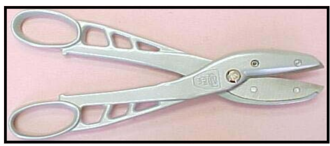
▲ 70295- M14 Tin Snips *Larger snips with more leverage, the preferred snips for all types of skirting. 14" length.